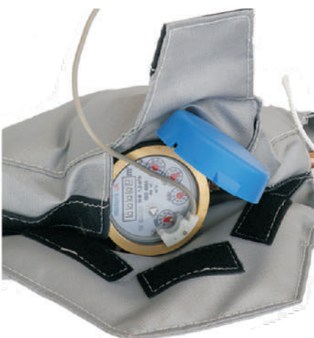
EASY ACCESS FOR MANUAL READING OF METER